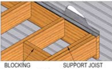
BLOCKING SUPPORT JOIST

STEP 1 SOLID & GROOVED: Add a support joist to the outside or inside of the outer joists. Insert the Rhino Deck flashing so that the shorter edge rests over the house ledger wood board and the longer plastic edge is inserted behind the house siding. Add notches in the Rhino Deck flashing to clear wood joists as needed. Add support blocking between joists on 4' center (prevents stringer movement). For longer spans/runs of decking please add additional support blocks throughout substructure, preventing twisting and adding rigidity.